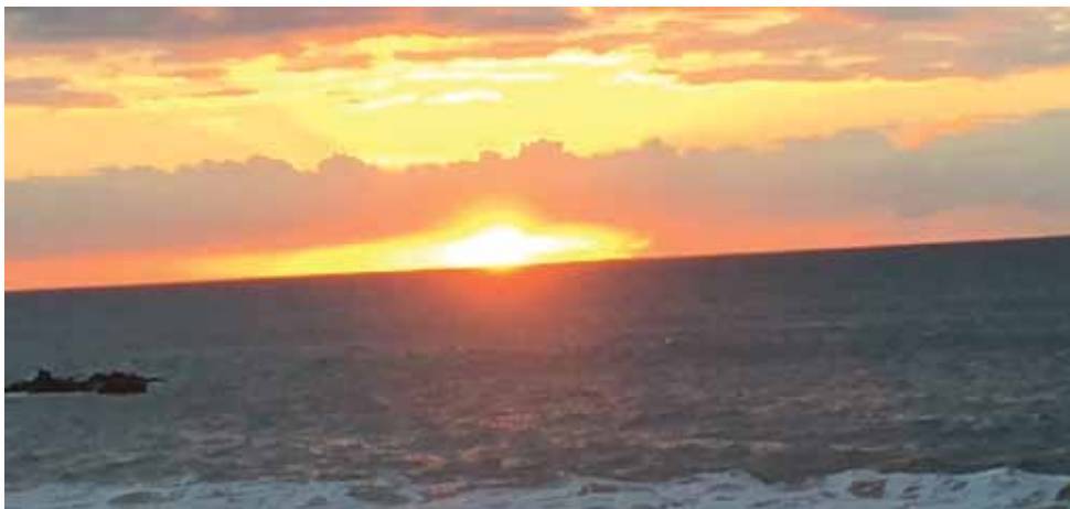
The sun sets over Kaanapali Beach at the Royal Lahaina on Maui