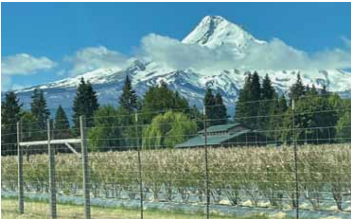
Mount Hood in the distance, part of Oregon: 2 Mountains and 2 Rivers, a June departure on page 11