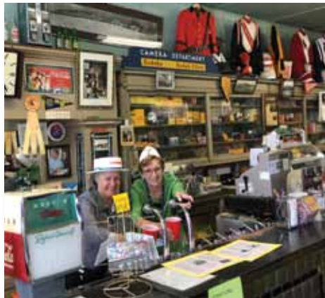
The "closed one day and never reopened" Rexall Drugs store in McGill takes you back to the 60's

US 50 in Nevada is not only the legendary "Loneliest Road in America," it's also part of America's first cross-country road, the Lincoln Highway. Not to mention it's full of quirky towns and the interesting people who inhabit them. Ever visited a bordello ladies? Take this trip and the answer will be YES! Take I-80 out to Wells, then drop down to Ely to hook up with the Lincoln., then travel the legendary highway from Ely to Sacramento.