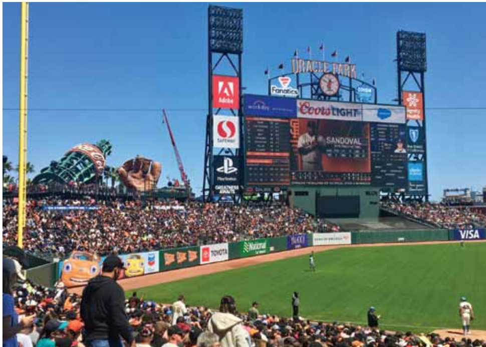
Giants Baseball in San Francisco 2025

Gifts may either be picked up at the Sports Leisure office, or, if you contact us, we can put your gifts on the bus for your first game.