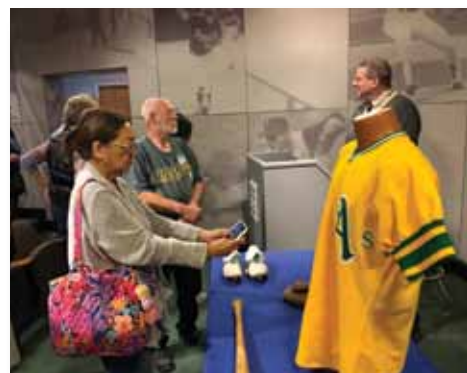
At the Baseball Hall of Fame, you'll see a special presentation of artifacts not on display in the museum

$4660 p.p./dbl.occ., $5375 single $135 EPD until Feb. 15