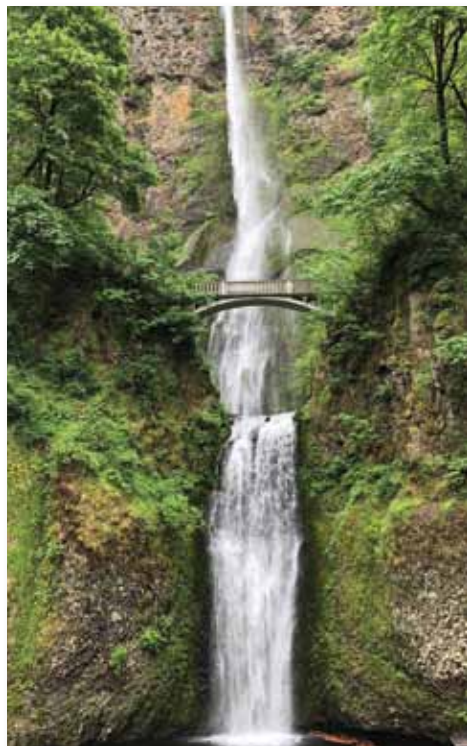
Multnomah Falls near Hood River

1. Depart Sacramento this morning on your one hour hop to Portland on Alaska Airlines. The Portland Spirit is awaiting your arrival, docked in downtown Portland. Enjoy Northwest cuisine, live piano music and friendly service on a 2-hour Willamette River lunch cruise. Heading by coach up the Columbia River, first stop is at Multnomah Falls, Oregon's tallest at over 600 feet!