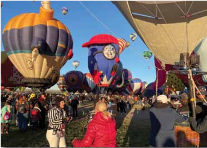
Add your name to the wait list and head to Albuquerque for the balloon Fiesta in October

"Grandma, we are packed and ready to go on your next Sports Leisure trip!"