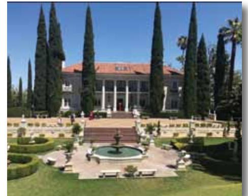
Grand Island Mansion

Come join us for a beautiful Easter Brunch at the delta's historic Grand Island Mansion which is a uniquely spectacular Italian Renaissance style villa. The Mansion is one of the largest private estates in northern California and embodies the finest features of classical architecture and European craftsmanship. Nestled in Walnut Grove along the Delta. $224