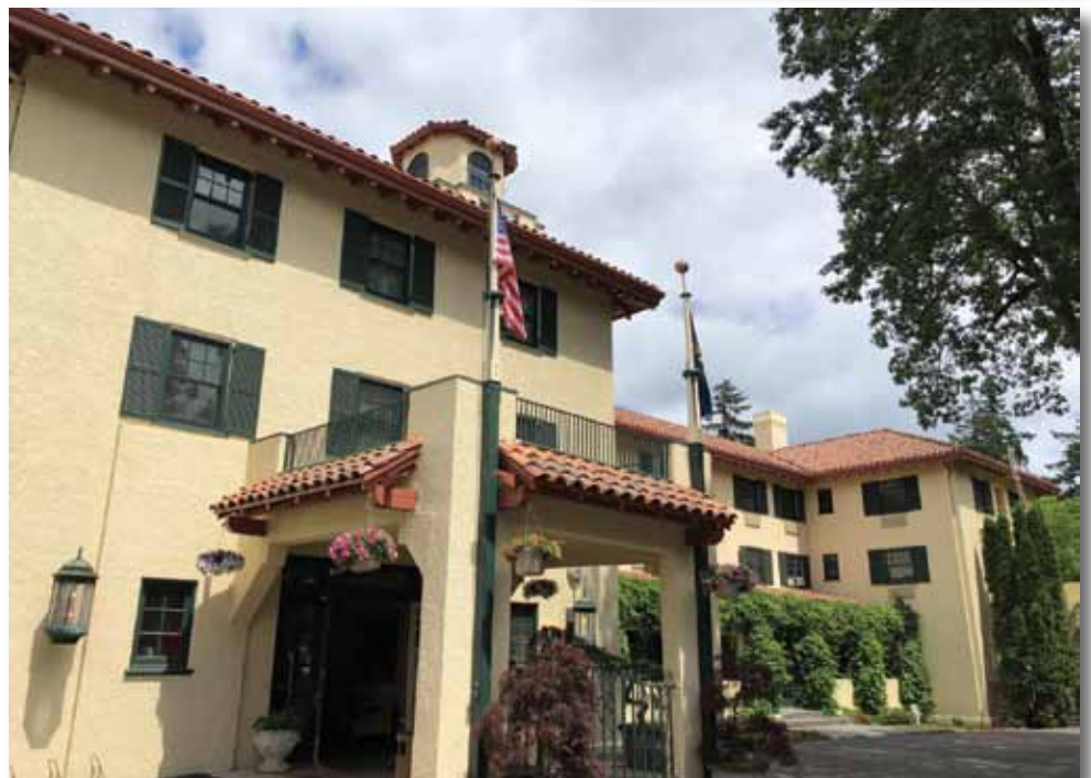
Enjoy dinner at the historic Columbia Gorge Hotel

See the back page for Early Payment Discounts