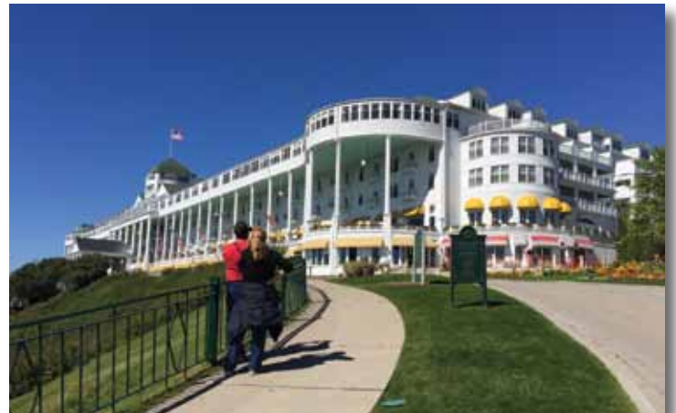
The Grand Hotel is featured on all of our Mackinac island tours