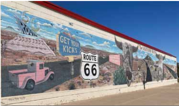
Route 66 celebrates its centennial in 2026. Watch your June newsletter for details.

OFFICE HOURS: 9:00am – 3:30pm MONDAY thru FRIDAY Closed weekends and major holidays CLOSED TUESDAYS 12:00pm – 1:15pm