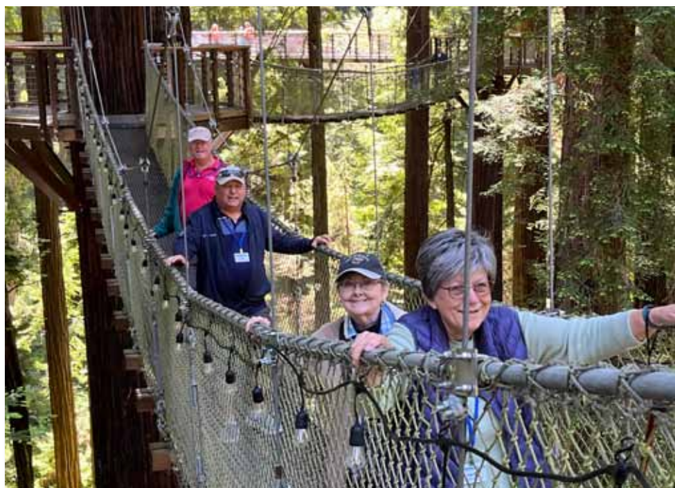
Walking among the big trees on the Redwood Sky Walk at the Sequoia Park Zoo in Eureka...

2-3. Two sightseeing trips highlight your days in Mammoth. The first includes a visit to Mono Lake. Mono Lake is an ancient saline lake located at the eastern edge of