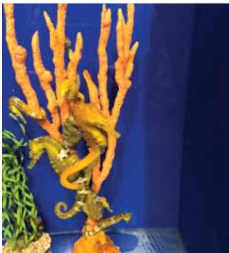
Meet seahorses up close and personal on the Big Island

the Westin, Hanalei Bay (home of Puff, The Magic Dragon), Waimea Canyon, Kauai Historical Museum, Lydgate Chocolate Farms Tour/Tasting