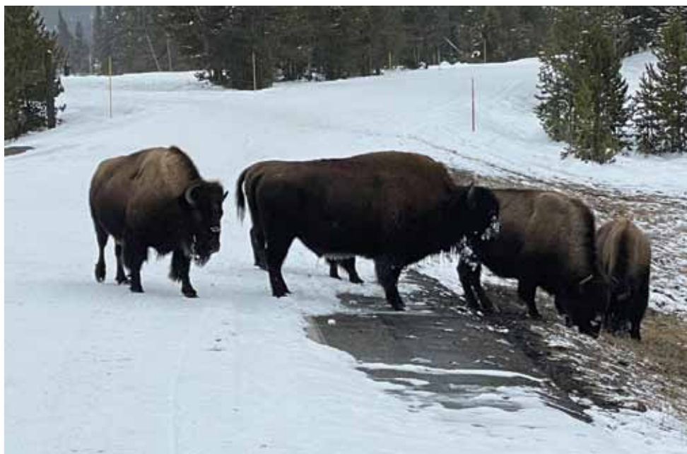
Yellowstone National Park – where the buffalo roam unbothered in winter