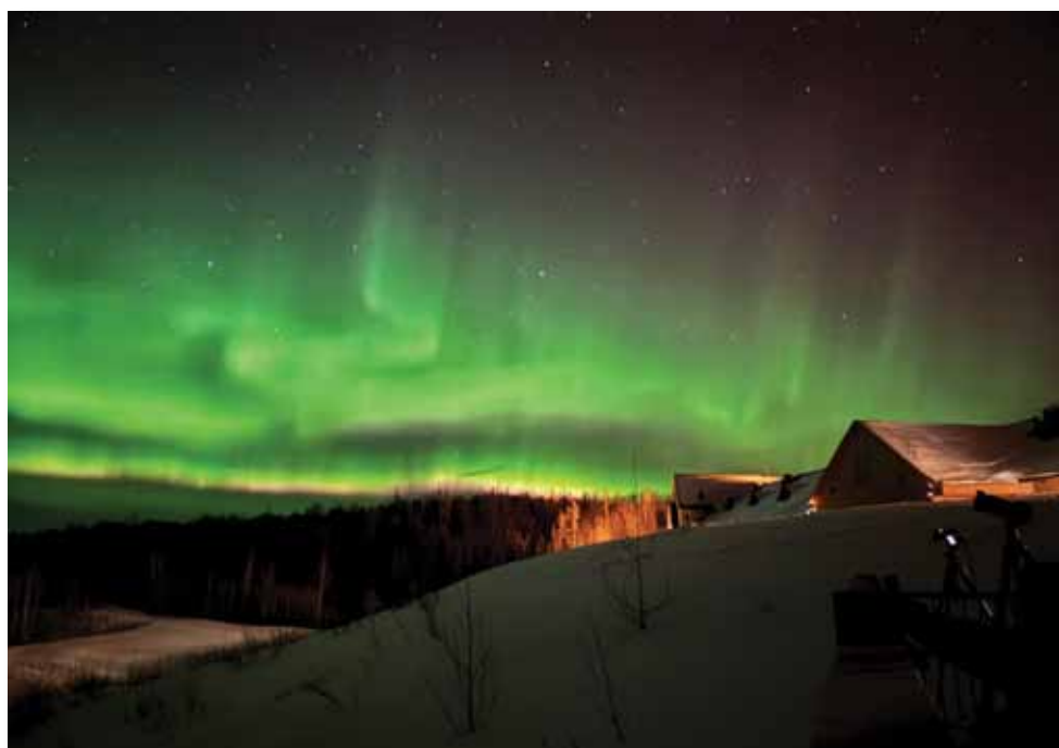
See Alaska's Northern Lights