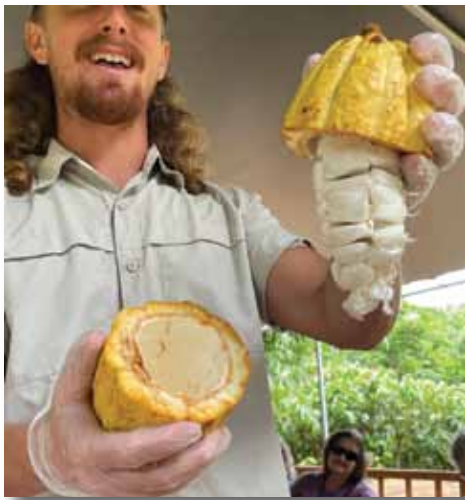
Ever wonder what the inside of a cacao plant looks like? Yes, that's the start of chocolate, as you'll see on your visit to Lydgate Farms