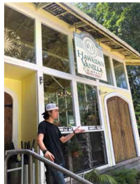
Visit the Hawaiian Vanilla Company for lunch and a tour on the Big Island next February