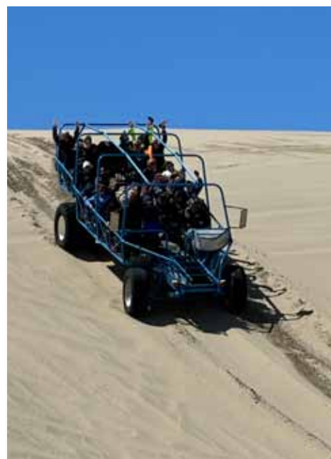
...Or riding over the dunes in a big buggy near Florence