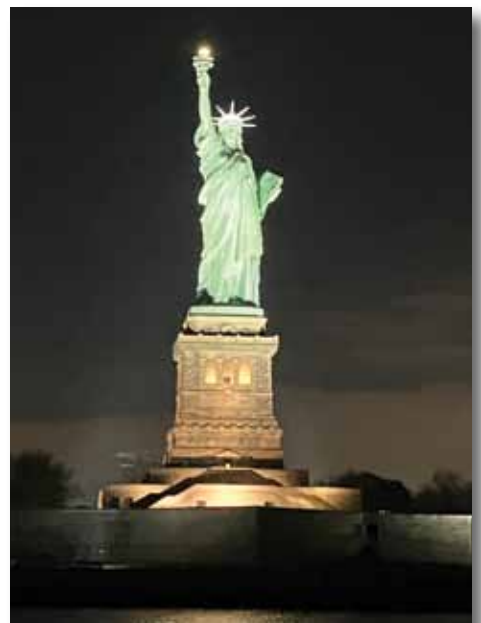
Weather permitting, see Lady Liberty on your Thanksgiving Dinner Cruise

3. Travel like a real New Yorker – by subway – Downtown for sightseeing focusing on the past and present of the World Trade Center. There you'll visit the 9/11 Memorial Museum and take in the breathtaking views from One